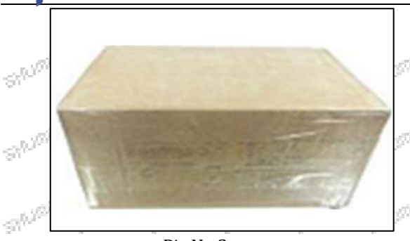
Pic No.2 Domestic express packaging: Wrapped by Transparent tape